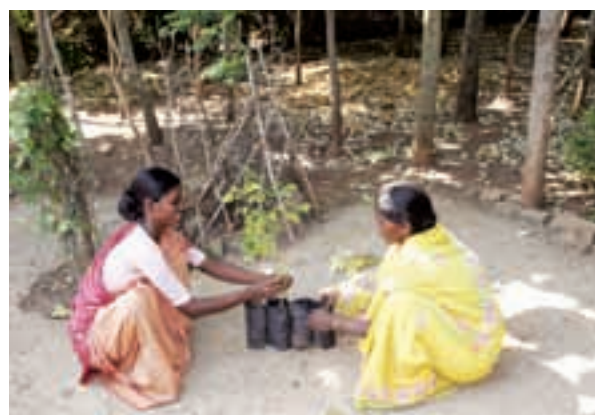
Can poor people gain carbon credits by planting trees?